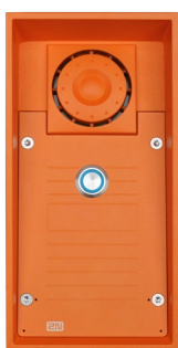
2N® Helios IP Safety