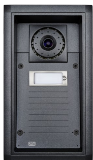
2N® Helios IP Force