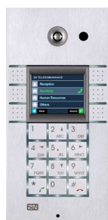
2N® Helios IP Vario