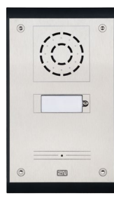
2N® Helios IP Uni

The 2N® Helios IP Uni family is a portfolio of door intercoms for all environments – whether for security, commercial or emergency communication in various locations. From simple applications requiring clear and simple communication to a single IP telephone, to comprehensive communication solutions integrated into security and alarm systems or IP switchboards.